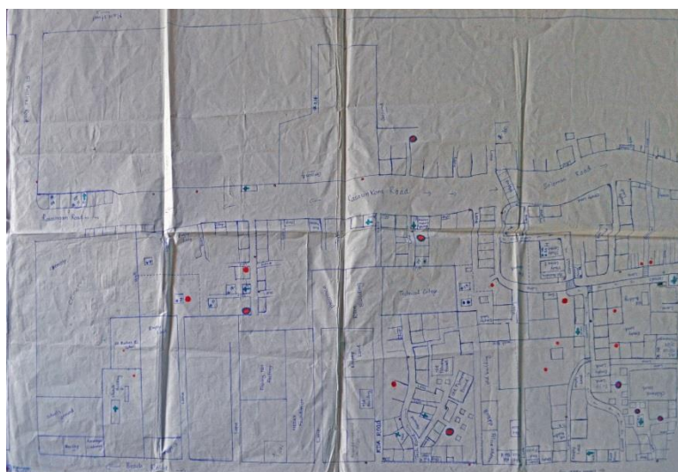
Figure 1: Entrance to Thirunagar from Rajasingham Road (left of map)

To the left of the entrance to Rajasingham Road there is a long line of corrugated metal sheets about a metre and a half high providing privacy for eight houses/households. A thin corrugated metal sheet separates each house from the next. The houses are not more than 1.5 sq meters. The walls are made of concrete and the roofs are made of corrugated metal sheets. Building materials are consistent in all of the housing in Thirunagar (apart from for two families of the same caste community), but plot sizes differ.