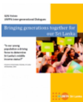
Generation to Generation Dialogue Available in Sinhala and Tamil (2015)