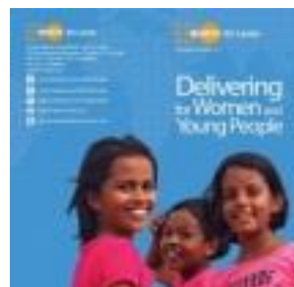
Delivering for Women and Young People (2014)