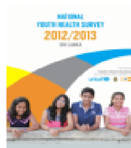
National Youth Health Survey 2012/2013 (2016)