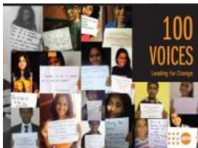
100 Voices Campaign Leading for Change (2015)