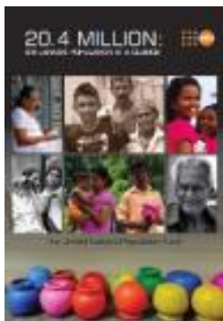
20.4 Million: Sri Lanka's Population at a glance (2015)