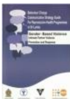
Behaviour Change Communication Strategy for Reproductive Health Programmes in Sri Lanka (2014)